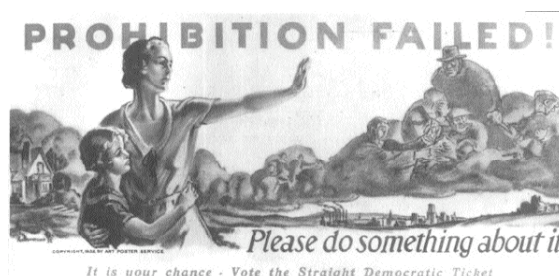
Poster from the Democrat campaign to end alcohol prohibition in the US, 1930s

Note: Transform is not responsible for the contents of these websites, which may contain views not necessarily shared by Transform.