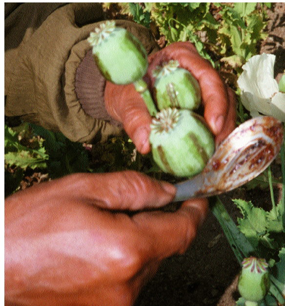
Illegal opium production.

prohibitions of the conventions. This decriminalisation trend has most commonly been associated with cannabis but in a number of countries it includes all drugs. It is a challenge to both the letter and spirit of prohibitionist legislation and will inevitably lead to more reasoned consideration of supply-side reforms. Whilst wider moves towards legalisation are still some time away, the decriminalisation trend appears to point the way to a challenge from a coalition of progressive states to reformulate or withdraw from the UN conventions. The aim will be to allow locally determined regulatory systems and bilateral trade agreements to be established.