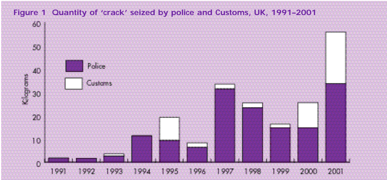
Figure 1 Quantity of 'crack' seized by police and Customs, UK, 1991-2001

The quantity of amphetamines recovered fell by only 2% in 2001 compared to a 14% fall in the previous year. The amount of herbal cannabis seized rose by 5% in 2001 to a little under 27 tonnes, whilst about 59 tonnes of cannabis resin was recovered – an increase of 22% on 2000 but only half the amount seized in 1997. The number of cannabis plants (71,500) seized showed a 49% increase on the previous year.